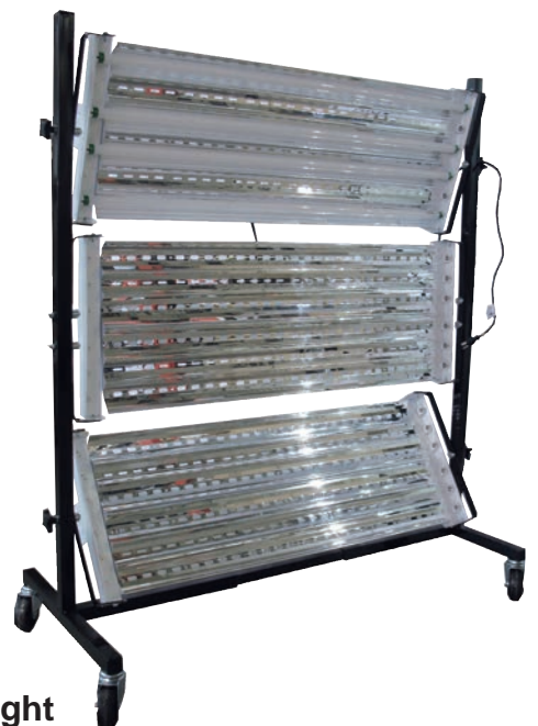
Assembled Champ Inspection Light

Place End Caps (G) on end of Frame Structure (A). Repeat on each corner.