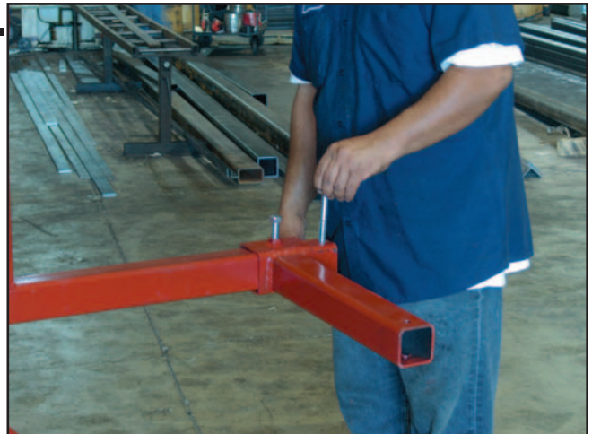
Tighten locking bolt. Safety pin MUST be in place before loading frame