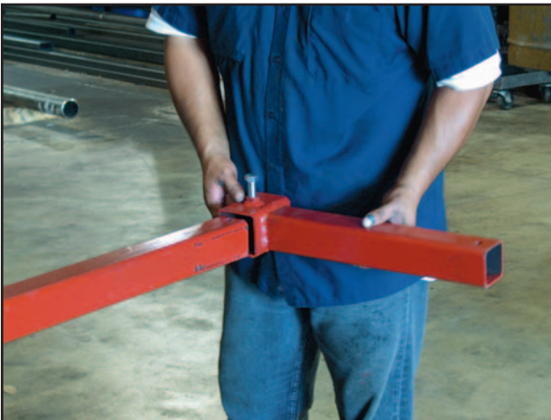
Bracket support arms are adjustable to fit vehicle frame.