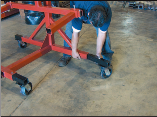
Install wheels into support base. Lock into place by tightening locking bolt.