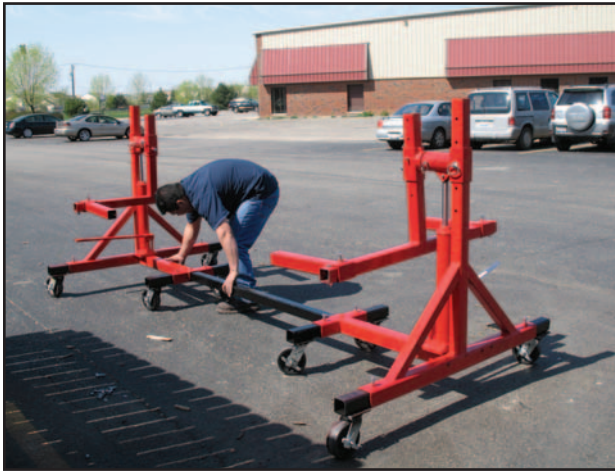
Beam being inserted.