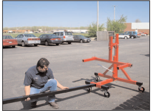
Insert Beam into Frame Supports Stands Beam Must Be In Place Before Loading Vehicle.