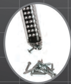
Dual Purpose Magnet