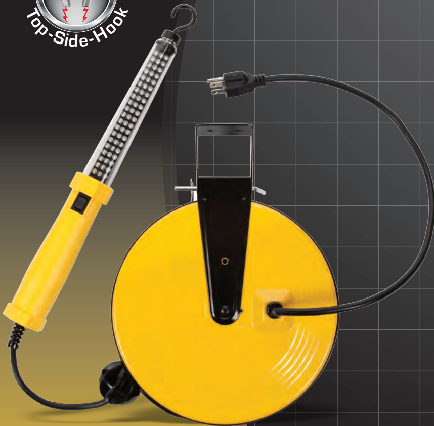
Model SL-864 50 ft. cord on retractable metal reel mounting kit included