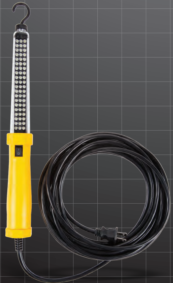
Model SL-2125 25 ft. cord